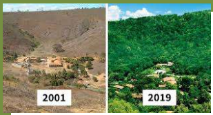
one family planting one tree a day for twenty years, replenished a whole valley that had turned to dust.

Small changes will add up to big impact over time. If local authorities and agencies are dragging their heels, there may be other ways of getting things done. It's often about getting the right people into a room.